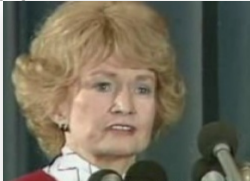
Margaret Heckler 15 th U.S. Secretary of HHS